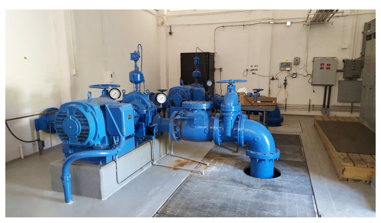
Figure 18. NWPS Piping Inside Building