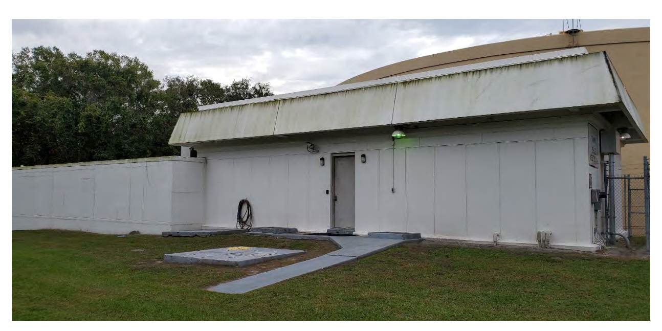
Figure 15. NWPS Building Exterior The wall is in poor condition.