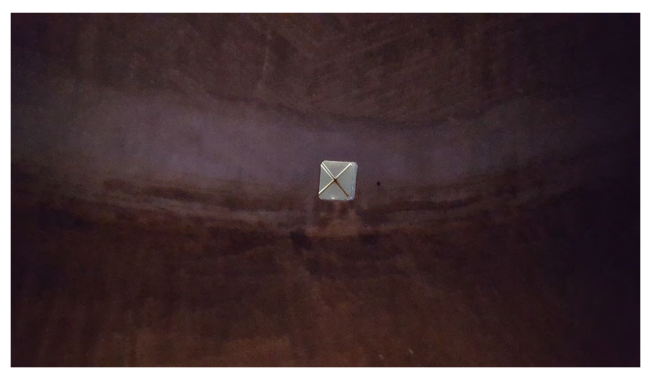
Figure 5. NWPS GST Hatch No access ladder from dome hatch.