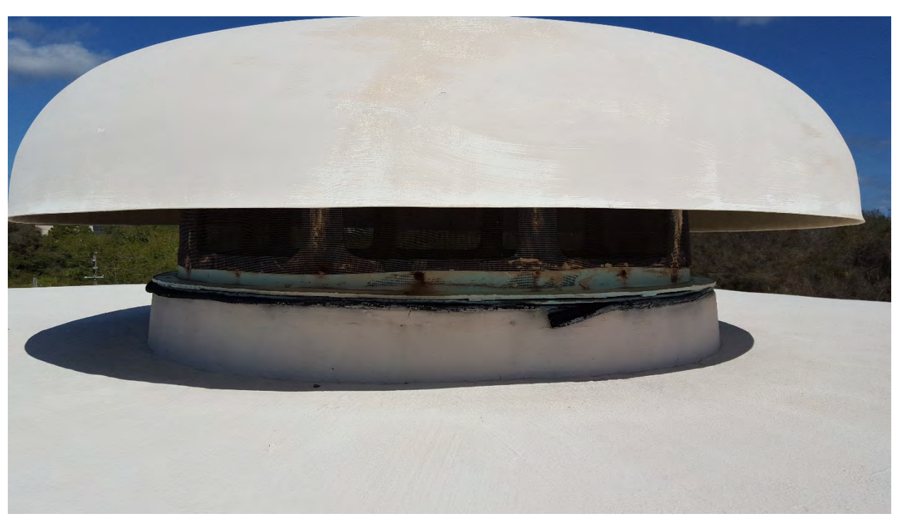
Figure 11. NWPS GST Center Dome Vent Corrosion on metal vent supports and cracking on vent curb.