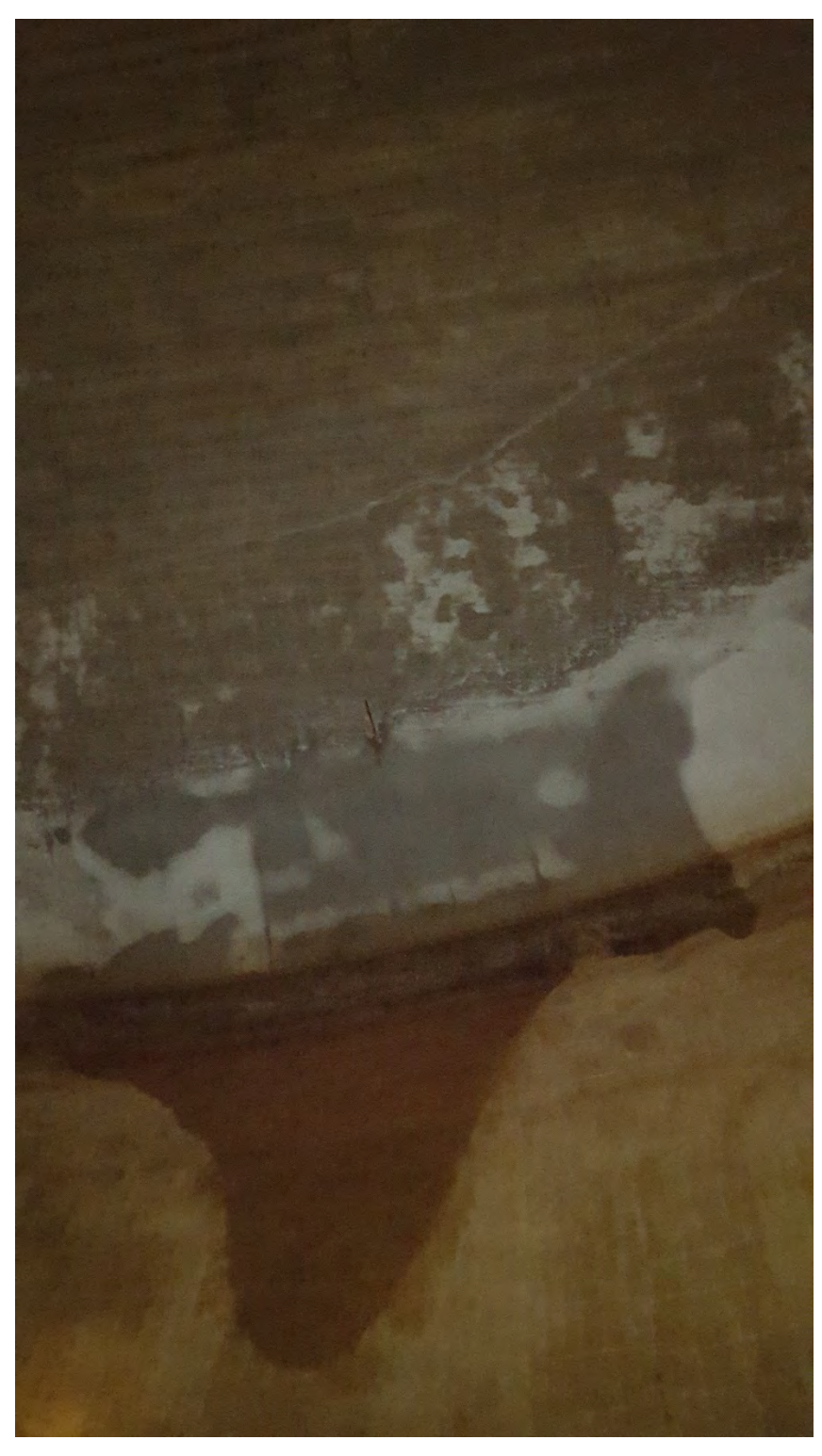
Figure 3. NWPS GST Interior Dome Cracks were present in the tank interior dome.