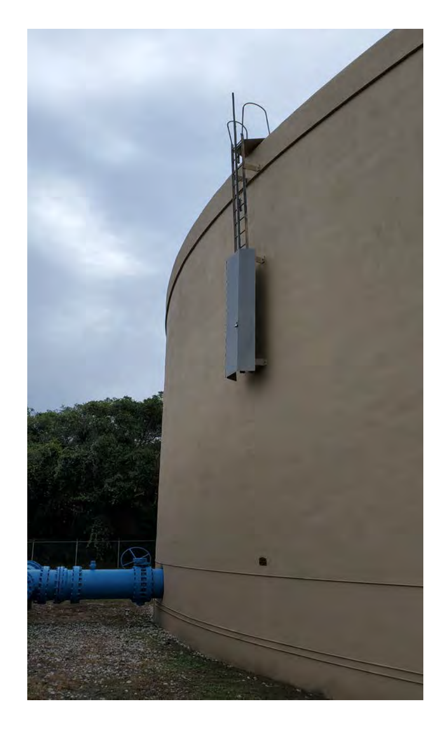
Figure 8. NWPS GST Exterior Ladder The exterior galvanized steel ladder and climbing device are in adequate condition with minor corrosion.