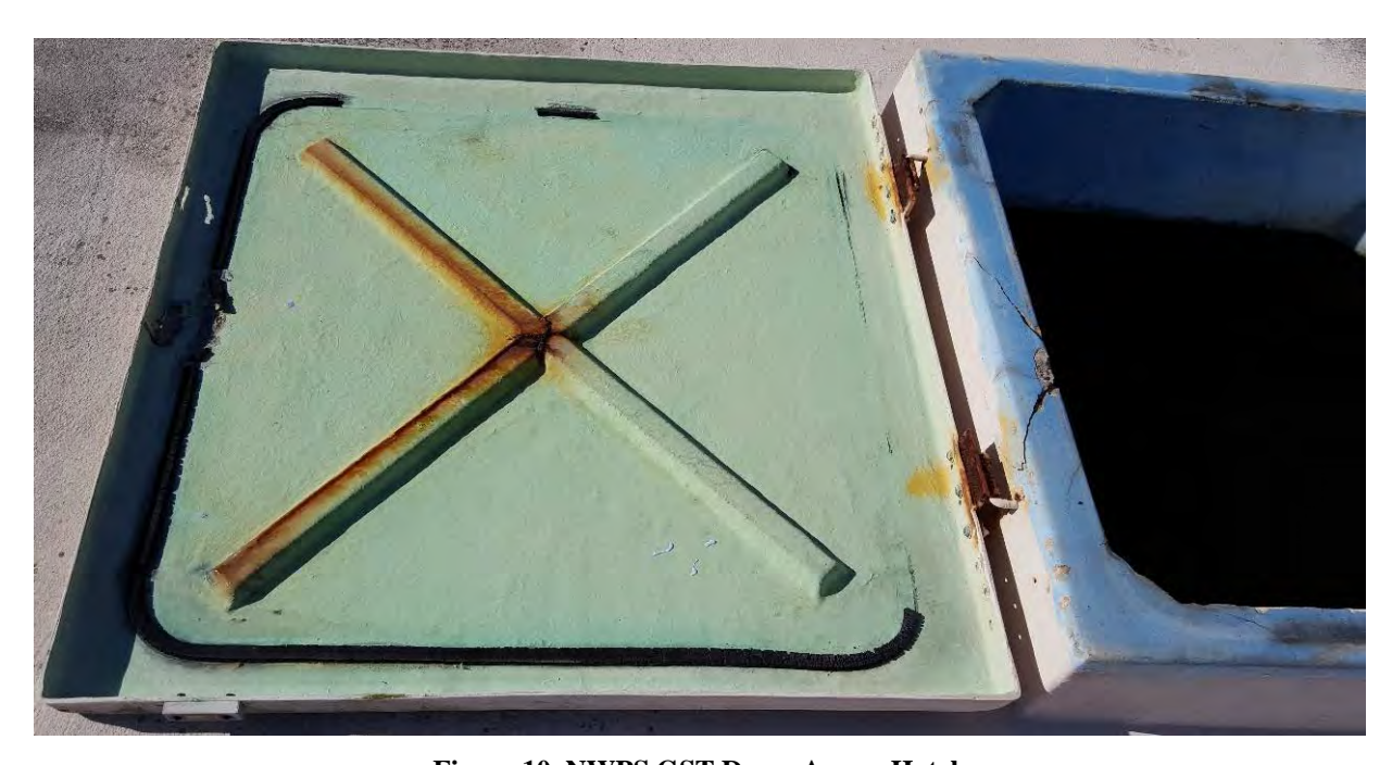
Figure 10. NWPS GST Dome Access Hatch

Hardware on the fiberglass access hatch was rusting. There was cracking on the hatch curb.