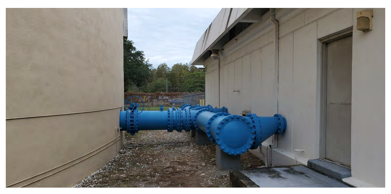
Figure 14. NWPS Building Exterior