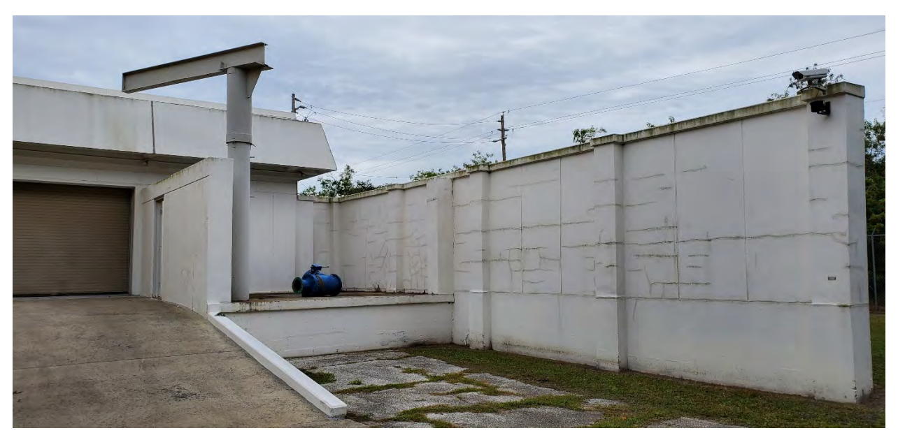
Figure 16. NWPS Building Exterior The wall is in poor condition.