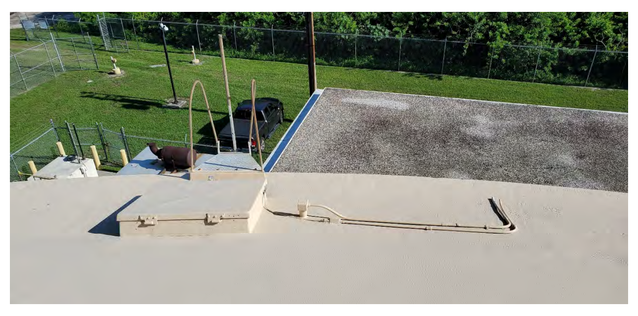
Figure 9. NWPS GST Dome Access Hatch There is no handrails and ladder cage.