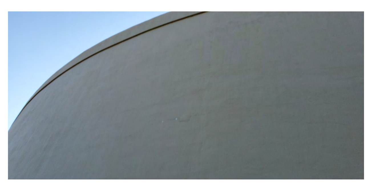
Figure 7. NWPS GST Exterior Tank Wall Cracks on the exterior tank wall.