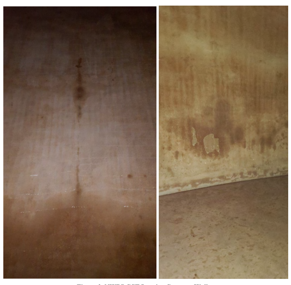
Figure 2. NWPS GST Interior Concrete Walls The interior tank wall had efflorescence along cracks in the concrete.