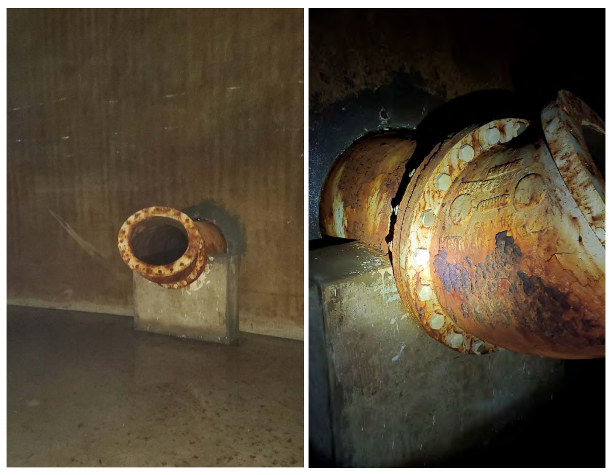
Figure 4. NWPS GST Interior DIP Pipe Corrosion on coated interior pipe.