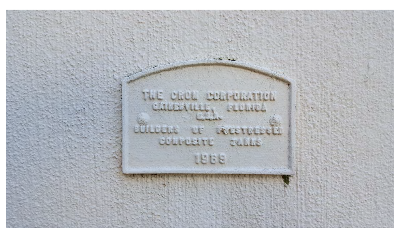
Figure 6. NWPS GST Identification Plate from 1969