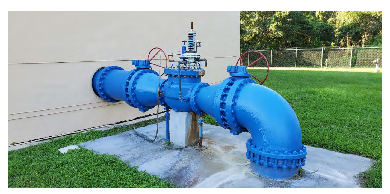
Figure 13. NWPS GST 24-inch Influent Line The altitude valve is in poor condition.