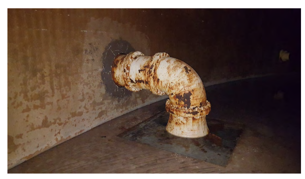
Figure 27. NWPS GST Interior DIP Pipe Corrosion on coated interior pipe.