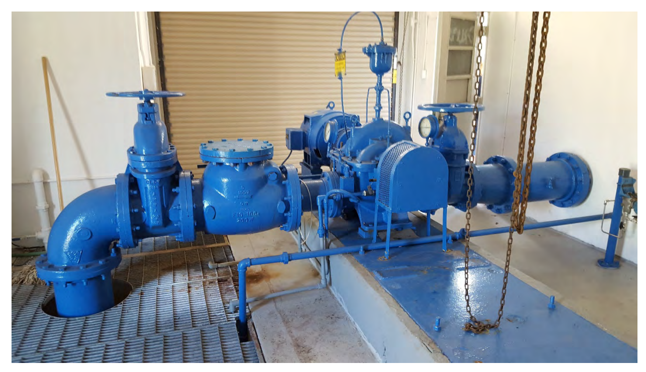
Figure 17. NWPS Piping Inside Building