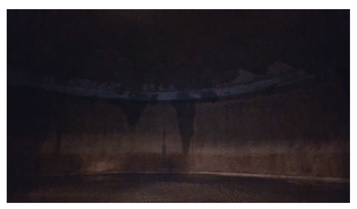
Figure 1. NWPS GST Interior