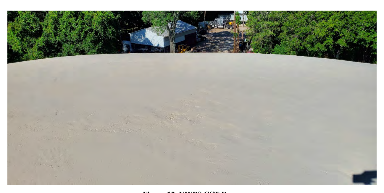
Figure 12. NWPS GST Dome Cracks were not visible on the dome.