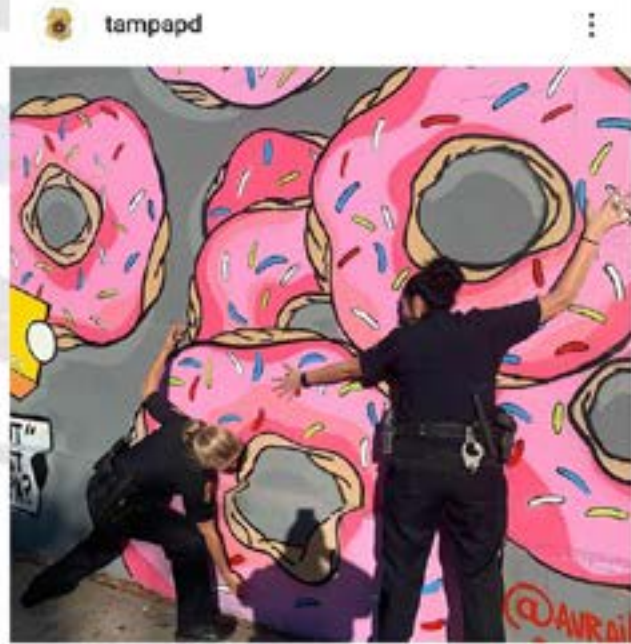
tampapd Liked by jakecalleoficial and 665 others tampapd #getinmybelly View all 23 comments cristadelamater Where is this located? tampapd @cristadelamater North Nebraska