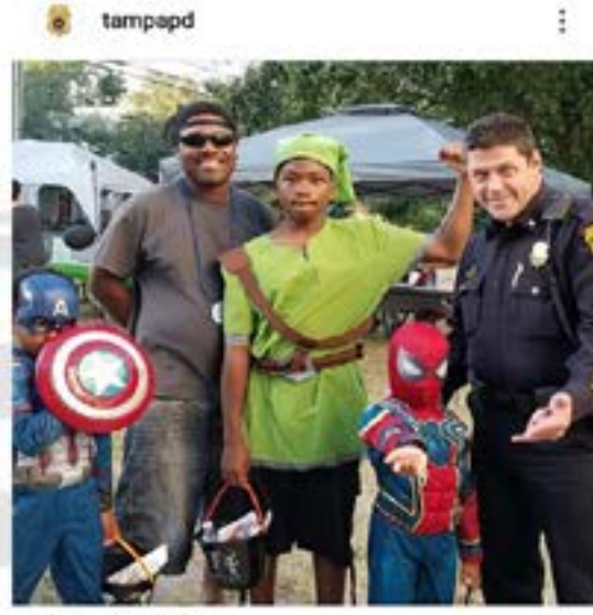
tampapd 217 likes tampapd Still floating on sugar vibes from all the fun we had handing out candy and keeping kids safe on Halloween #FridayFeeling #Mood #CommunityPolicing