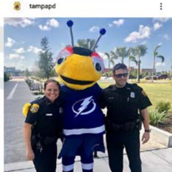
tampapd 308 likes tampapd Go Bolts! #thunderbug