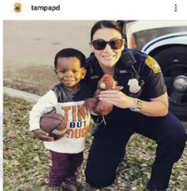
tampapd Liked by maggie_lzq and 542 others tampapd #tinyBUTtough #TampaPd #tistheseason