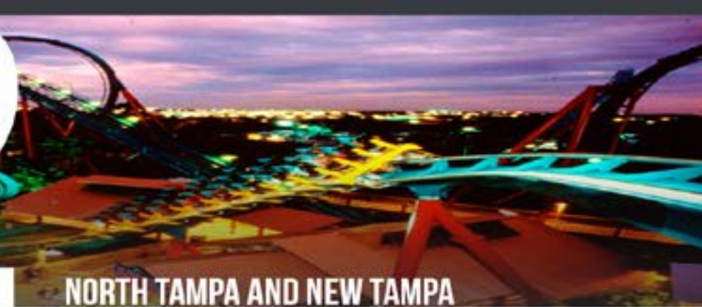
NORTH TAMPA AND NEW TAMPA

2019 saw the rebirth of the Resources In the Community House (R.I.C.H.) house in Sulphur Springs. The original duplex was the result of an asset forfeiture in the late 1980's of a notorious crack house in the Sulphur Springs Community. Officers of that era used their own skills to remodel the house the best that they could which then served for over two decades as a safe place for children to go after school to do their homework, interact with Tampa Police Officers in a positive manner, play games and safely do activities in one of the highest crimes neighborhoods.