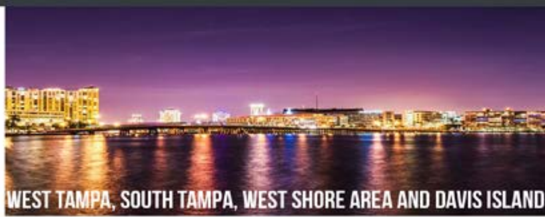
WEST TAMPA, SOUTH TAMPA, WEST SHORE AREA AND DAVIS ISLAND

Throughout the year we have implemented numerous operations targeting various crimes and complaints from the community, including the targeting of commercial burglaries. In March 2019 we experienced a spree involving a subject shattering the front doors to closed businesses. An operational plan was implemented involving patrol officers and Street Anti Crime officers. We ultimately arrested the suspect, a repeat offender that had just been released from prison for a similar crime spree two years earlier. His arrest stopped the burglary pattern. Proactive patrols of both Ben T. Davis Beach and the Courtney Campbell Causeway were conducted over Easter weekend. The beaches are extremely busy during the holiday weekend. SAC officers were reassigned to assist with traffic flow and the safety of patrons. As a result, no injuries were reported.