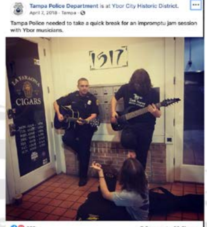
Tampa Police Department is at Ybor City Historic District. April 7, 2019 · Tampa · 📍 Tampa Police needed to take a quick break for an impromptu jam session with Ybor musicians.