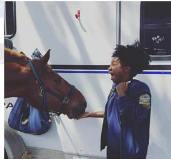
tampapd 328 likes tampapd When a dispatcher finds out that Pike not only wanted the treat but ALL the crumbs to go with it #ntw #dispatcher #npstw2019 #mountedpatrol