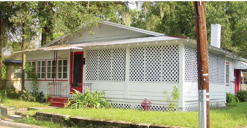
Housing Rehabilitation Program in action: top right: home before repair, bottom right: home after repair.