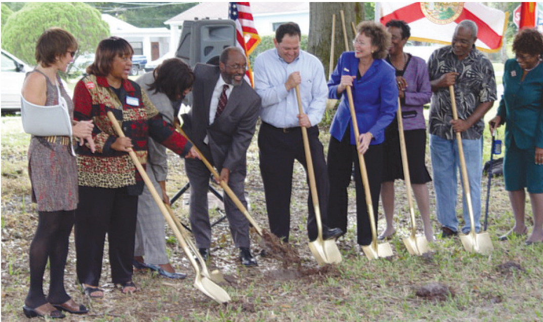
Groundbreaking for the Fast Lane Clothing Company. Check out the Fast Lane link by logging onto www.TampaTshirts.com .

The City of Tampa provided a $211,471 deferred payment loan (DPL) through the Community Development Block Grant (CDBG) to