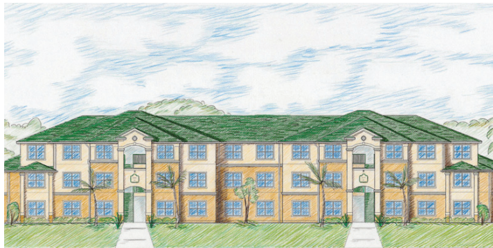
Rendering of Park Terrace Apartments.

The City of Tampa is providing $200,000 of SHIP funds to the Creative Choice Housing Group to bring 215 units of affordable rental units to the North 43rd Street area.