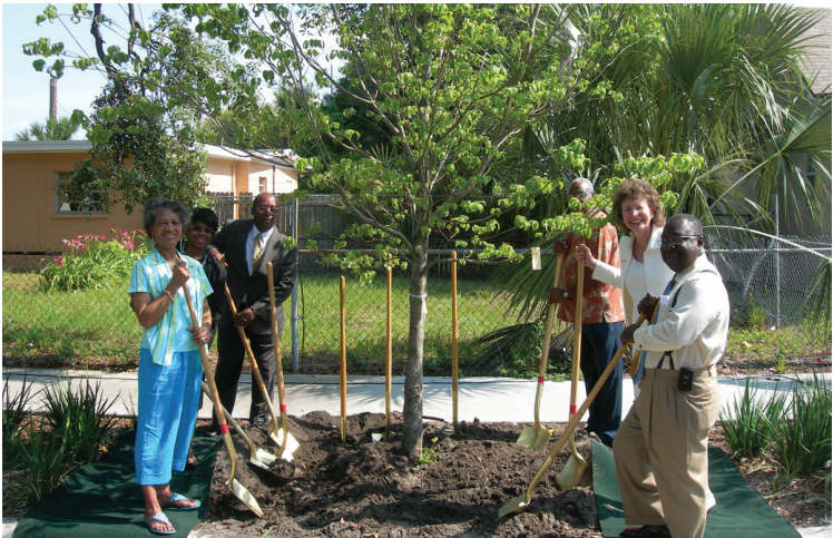
Tree planting ceremony commemorating the completion of Lake Avenue.

The enhancement of Lake Avenue spans from North 22nd Street to North 29th Street. The improvements include an attractive roadway with pedestrian friendly sidewalks with a public art component, bicycle lanes, landscaped intersections, upgraded traffic signals, and improved bus stops and shelters. The project began in 2006 and was completed at a total cost of $2.73 million. Funding for the project was provided by Gas Tax and East Tampa TIF revenues.