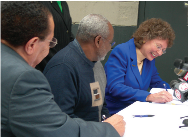
Signing ceremony commemorating the purchase of Gene's Bar.

As part of the city's initiative to lower crime in the community, the city purchased Gene's Bar, located at 22nd Street and 21st Avenue, in February 2006. This location offers a great opportunity for potential commercial development.