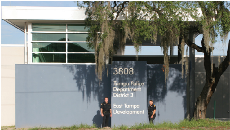
TPD District III station.

features of the site include a memorial honoring the accomplishments of the Belmont Heights Little League and the contributions of Tampa's African-American police officers.