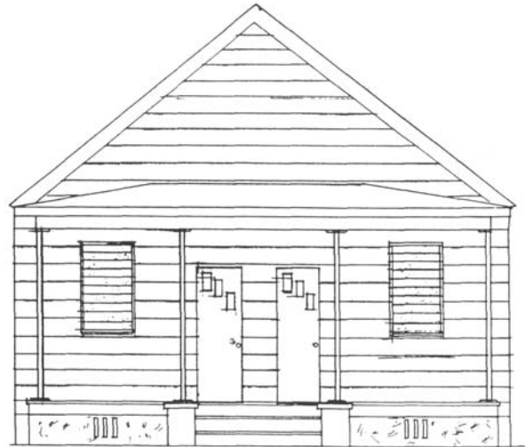
Inappropriate residential rehabilitation