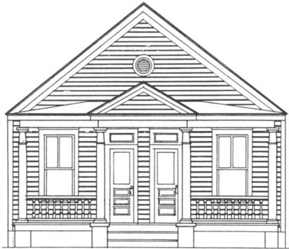
Appropriate residential rehabilitation

The loss of the porch pediment, the vent in the gable, the wooden columns which support the porch roof, and the turned porch railings deprive the house of needed style and ornamentation. The replacement of original doors and windows with flush doors and jalousie windows detracts from the appearance, as does the stucco material used on the foundation.