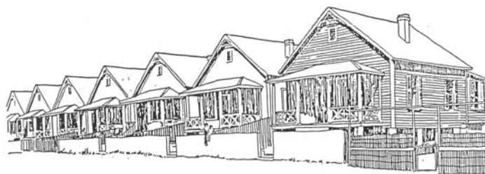
Typical residential street

The typical neighborhood commercial building is a two-story structure also of wood balloon frame construction. The overall size and floor plan reflects the reduced bearing capacity of light wood framing as contrasted with the brick masonry and heavy timber construction of much of the Central Commercial Core. There are isolated examples of masonry commercial buildings in these sub-districts.