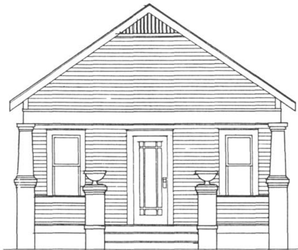
Appropriate residential rehabilitation

The residence to the right has been modernized with a combination of inappropriate building materials and decorative items which detract from its historicity and charm rather than enhance or refurbish it. Inappropriate replacement windows, doors, porch supports, railings, exterior siding and decorative lamps and door hinges have altered the houses appearance without improving it.