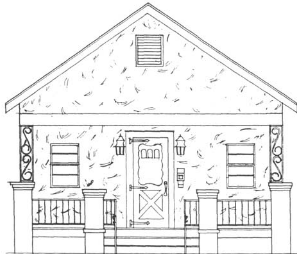
Inappropriate residential rehabilitation