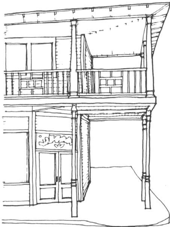
Appropriate neighborhood commercial rehabilitation

The building on the right has replaced many of its original features with items that are incongruous with the character of the frame building. These items include vertical metal siding, wrought iron balcony railings and security bars, and windows that are either boarded up or replaced with jalousies.