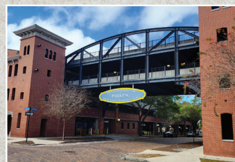
Fernando Noriega, Jr. Parking Garage

Once known as the hand-rolled cigar capital of the world, today's Ybor City is an eclectic mix of cutting-edge culture with a passion for the past.