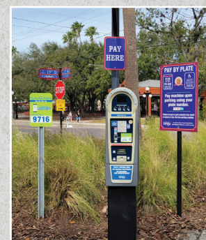
Surface lot automated pay station

Designated rideshare drop-off and pick-up is located at the following intersections: 15th Street and 7th Avenue 18th Street and 7th Avenue 19th Street and 7th Avenue