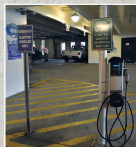
Electric vehicle charging station

The City's Centro Ybor parking garage is located at 1500 E. 5th Avenue. The Fernando Noriega Jr. garage is at 2010 N. 13th Street. Both garages are well lit and open 24 hours seven days a week. There are electric vehicle charging stations available at both locations.