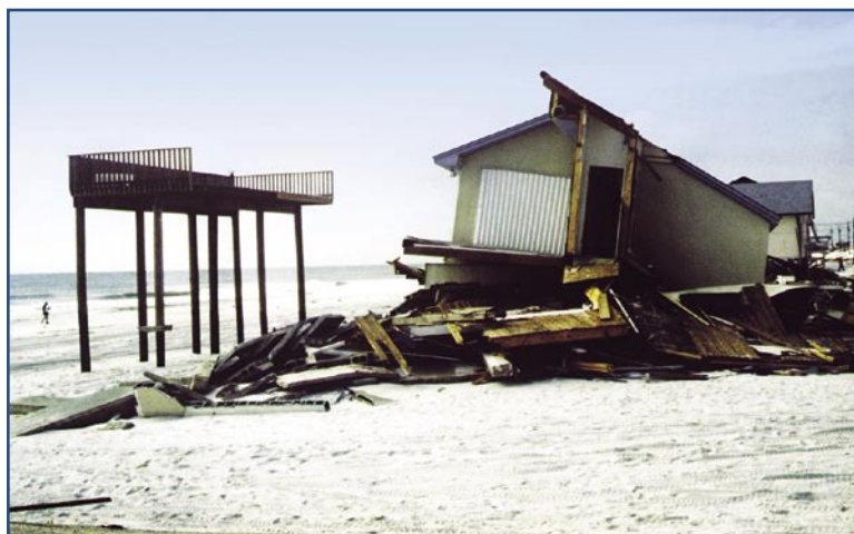
Damage from Hurricane Opal in Florida. This deck was designed to meet State of Florida Coastal Construction Control Line (CCCL) requirements. The house predated the CCCL and was not.