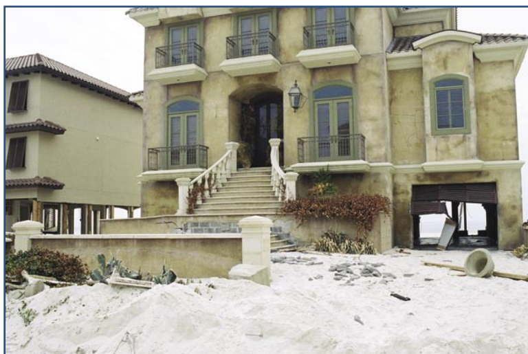
Large solid stairs such as these block flow under a building and are a violation of NFIP free-of-obstruction requirements.