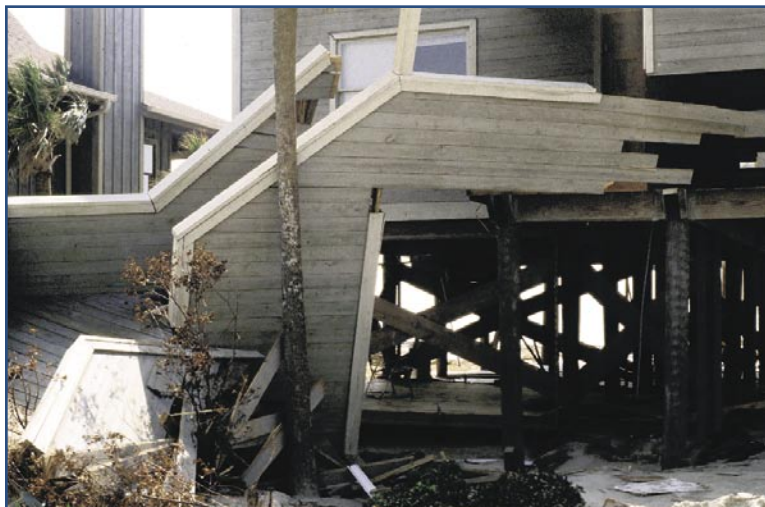
The rails on these stairs were enclosed with siding, presenting a greater obstacle to the flow of flood water and contributing to the flood damage shown here.