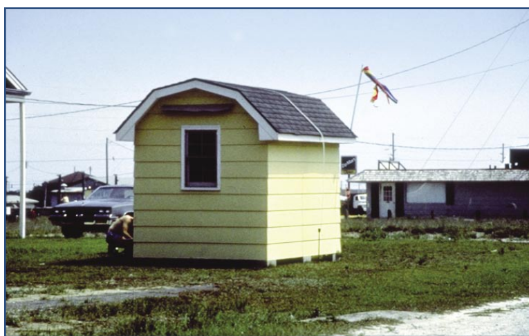
Small accessory building anchored to resist wind forces.