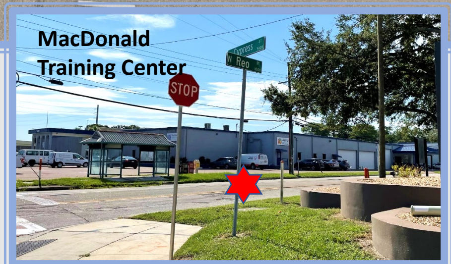
MacDonald Training Center

The installation site is adjacent to the MacDonald Training Center located at 5402 W. Cypress Street.