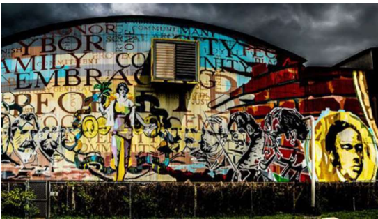
Ybor City I and II