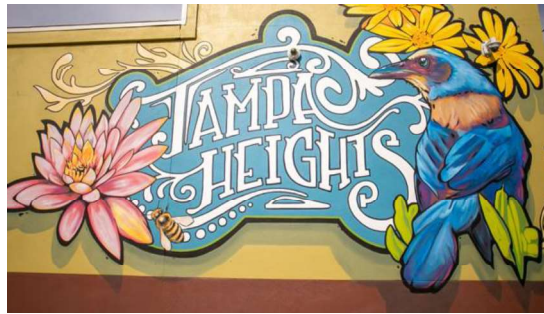
Tampa Heights Riverfront