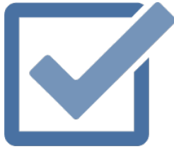
A Suitable Living Environment