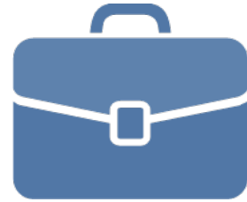
Expand Economic Opportunities

The Community Development Block Grant (CDBG) entitlement program allocates annual funding to larger cities and urban counties to develop viable communities by providing decent housing, a suitable living environment, and opportunities to expand economic opportunities, principally for low-moderate income individuals/households within the City of Tampa.