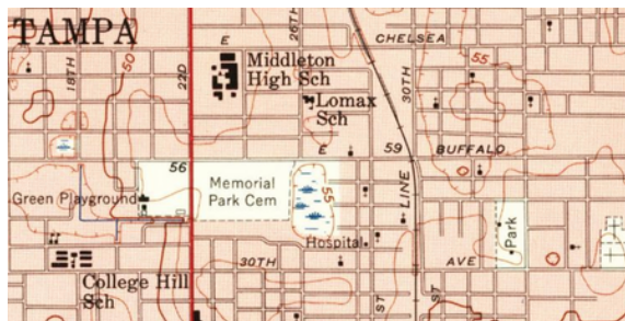
1956 USGS Tampa Map; Historical Topographic Map Collection courtesy of the U.S. Geological Survey, Esri

Prior to 1964, “segregation era” often meant racial separation even in death—with Black people and white people buried in separate cemeteries or separate sections of cemeteries. Work is underway throughout the Tampa Bay area to identify and memorialize burial locations of Black residents which have often been built over, ignored, under-resourced, and erased from public records and hometown histories.