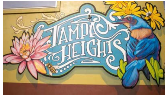
Tampa Heights Riverfront