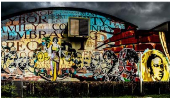
Ybor City I and II