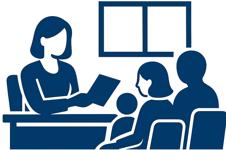
Public Service (PS)