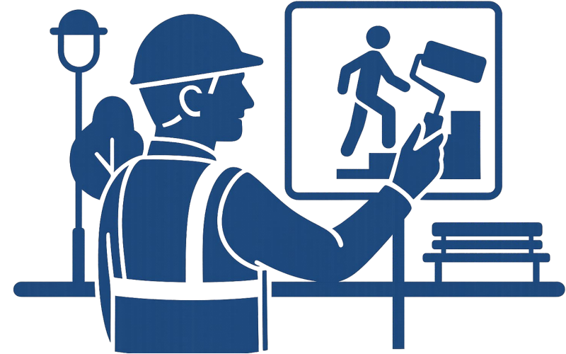
Public Facilities (PF)