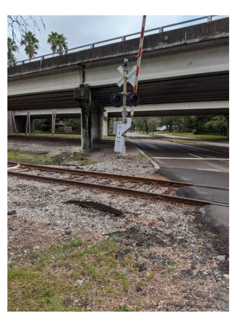
Figure 10: CSX Rail crossing with no sidewalk on north side