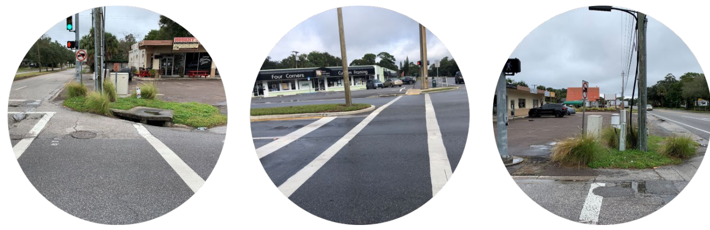
Figure 12: Long crossing distances for pedestrians and lack of ramps and landings make intersections dangerous and inaccessible.

All signalized intersections should be analyzed to determine needed operational and safety improvements, especially considering the proposed lane diet. Unwarranted space may be used to better serve multimodal users. Crossing distances should be reduced and opportunities for pedestrian refuge islands should be evaluated. Signal timings, bike specific striping (bike boxes), cyclist detection, right turn restrictions, and leading pedestrian intervals (LPI) should be considered.