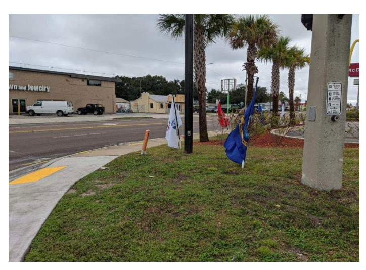
Figure 9: Inaccessible push buttons at West Shore Blvd. and Dale Mabry Hwy, left and right, respectively