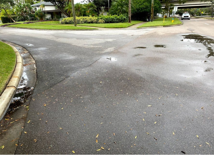
Figure 13: Mid-block median openings may not allow U-turns under proposed conditions (left); Drexel Ave. is a skewed intersection with a wide throat (right)