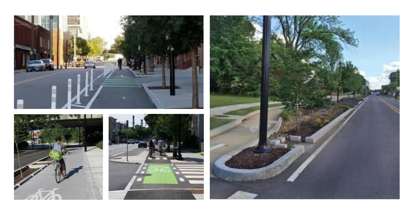
Figure 6: Examples of Separated Bike Lanes, including crossing markings and LID Measures