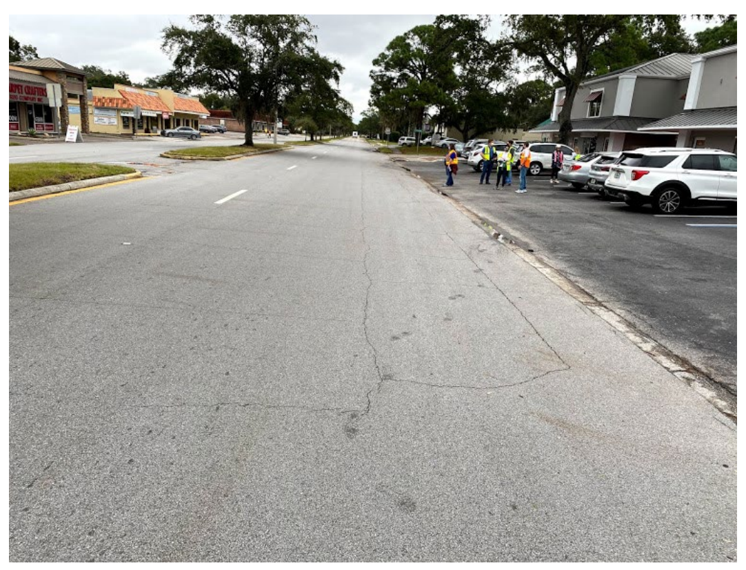
Figure 5: Business District near Manhattan Ave. with wide pavement widths that may accommodate parking and long curb cuts that may be consolidated.

There is a small business district between Hesperides St. and Lois Ave. near the Manhattan Ave. intersection. The pavement widths widen considerably in this section. Several of the businesses have wide curb cuts and parking encroachments within the right-of-way. Considering the wider pavement widths present in this area, on-street parking and/or curbside pick-up/drop-off spaces may be options.