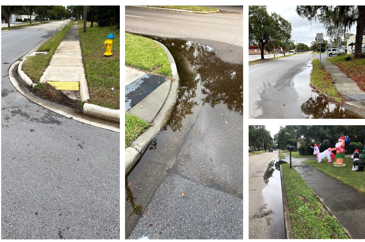
Figure 15: Ponding and sediment in walkways and bikeways create obstacles that reduce the viability of alternate modes

There were several areas of ponding encountered during the on-site audit. Removing ponding through low maintenance methods should be included within the design. Special notice should be placed on ponding within curb ramps and proposed bicycle facilities.