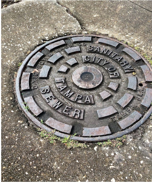
Figure 8: Drainage inlet within sidewalk in area of sidewalk swale (left); sanitary sewer manhole cover within southside sidewalks (right)