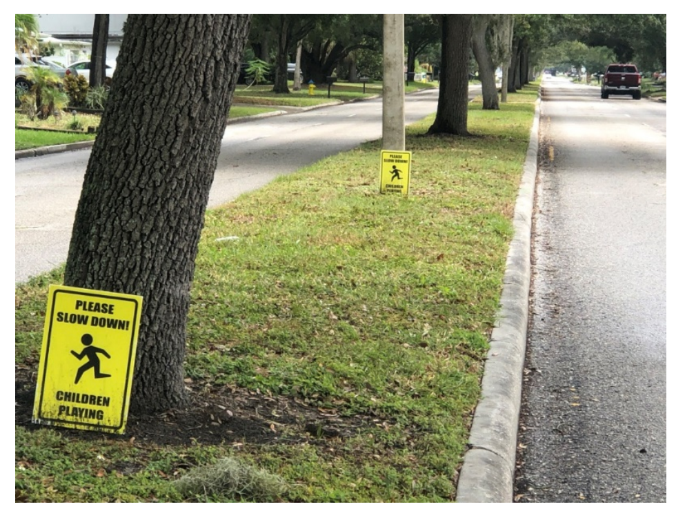
Figure 14: El Prado residents have already attempted to slow traffic on their own by placing these placards in the median

Traffic calming along the corridor should be considered. In addition to narrow lanes and enhanced signage and striping, horizontal and vertical deflection should be evaluated as part of the project. The City has incorporated horizontal and vertical deflection as a means to calm traffic on other recent projects. The Hampton Terrace and Ridgewood Park Neighborhood Traffic Calming Projects employed raised medians,