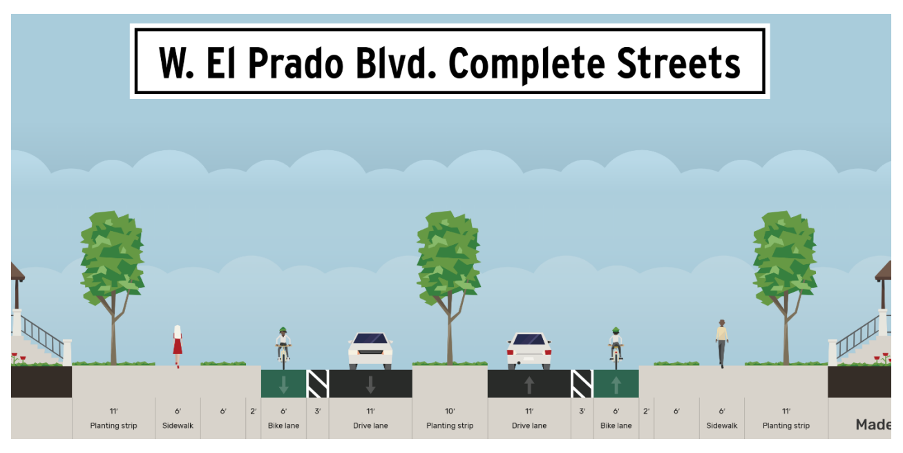
Figure 4: City Recommended Alternative

The project recommendation that the City has developed comprises repurposing one vehicular travel lane in each direction into a 6-foot wide bike lane with a 3-foot physical buffer where possible. One 10-foot wide vehicular travel lane will remain in each direction.