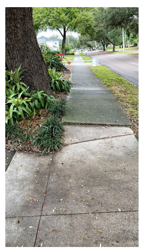
Figure 16: The City will look to rehabilitate the corridor assets; broken curb, pavement failures, and upheaved sidewalks should be evaluated for correction.