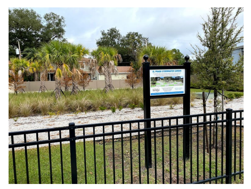
Figure 11: Existing El Prado Stormwater Pond

Wayfinding to other connectors and community assets such as parks and schools should be explored by the City, either within this project or citywide. Other opportunities can be explored with maintaining agencies, such as the Dale Mabry intersection (FDOT) and the LeeRoy Selmon Expressway underpass (THEA). As a portion of this project is federallyfunded, a Cultural Resource Assessment will need to be done. Historic features such as granite curb, vitrified clay brick, and any sidewalk cartouches should be preserved.