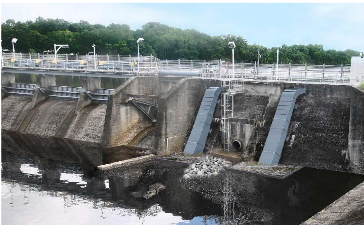
Dual Siphon (Downstream View) at Vertical, Non-spillway Section of Dam

Interconnection options considered included: 1) Alternate/Backup Supply at the Sludge Processing Facility; 2) Alternate/Backup Supply to the DLTWTF; 3) Parallel Interconnection to the SPF; and 4) Parallel Interconnection to the DLTWTF. Another possibility arose subsequent to the completion of the Proof-of-Concept Study: Alternate/Backup supply to the planned Water Center that is planned to be located near the South Abutment of the Dam.