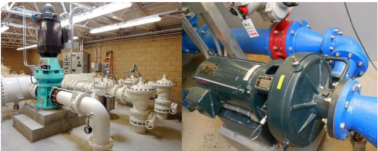
Francis Turbine (Left) and Pump as Turbine (Right) Examples

Available technologies were reviewed and two were selected for screening: turbines (both reactive and impulse) and pumps as turbines. The recovery unit would have an anticipated production rate between 50 kW and 75 kW based on an average maximum flow of 10.06 mgd corresponding to a pressure of 38.4 psi and an average minimum flow of 4.62 mgd corresponding to a pressure of 51 psi. The unit would be capable of operating continually since the station is operated 24 hours per day. The generating voltage for the energy recovery unit would be the same as that used at the station. Alternatively, an electrical connection could be provided to the Tampa Electric grid.